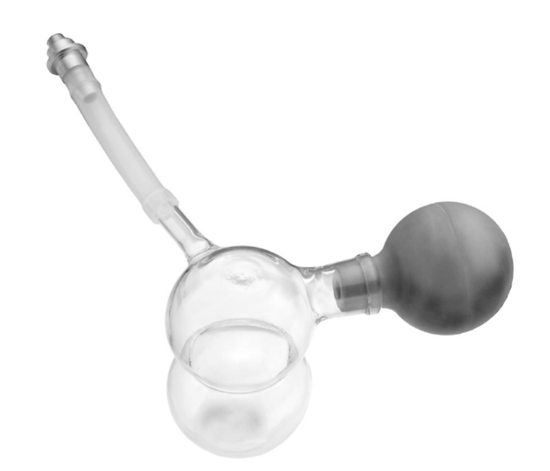
Evacuator " ELLIK " With adaptor T5090500