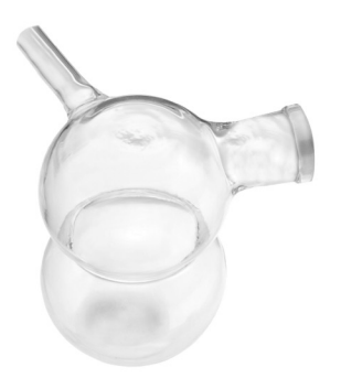
Glass receptacle For evacuator ellik ref. T9090500 or T5090500 T9090502

T9090000 75 ml T9090100 100 ml T9090200 150 ml