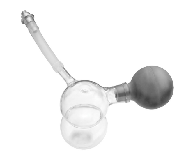
Evacuator "ELLIK" With SC series adaptor T9090500